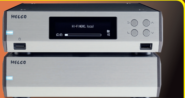
Melco N10/2 Flagship digital music library

Marantz Model 40n New network-attached amplifier